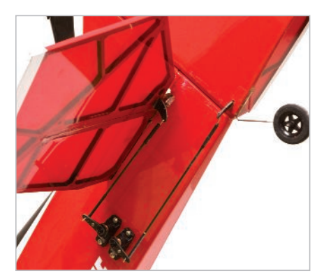
Carbon-fiber servo arm extenders and stiff pushrods promote better control response.

attached the motor, I used tie wraps to secure the Quantum ESC to the side of the box for good cooling. I used the iPAs Pro package for this review model (see sidebar).